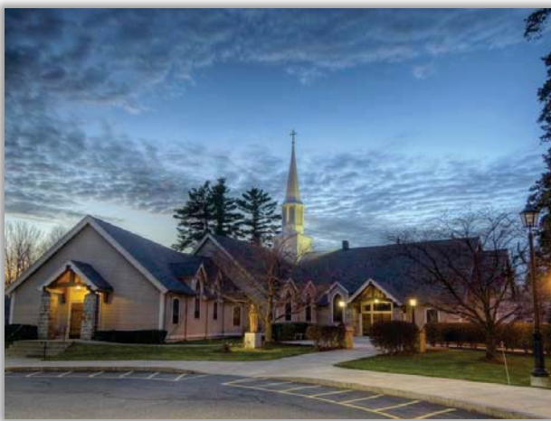
St. Monica Parish