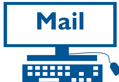
To your inbox

Sign Up at www.pilotbulletins.net/sign-up